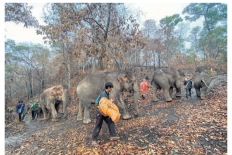
In this Thursday, April 30, 2020, photo provided by Save Elephant Foundation, a herd of 11 elephants walk with guides during a 150-kilometer (93 mile) journey from Mae Wang to Ban Huay in northern Thailand.